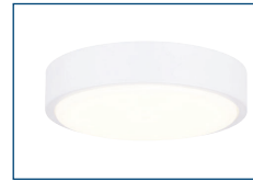
LK-CPWH - White