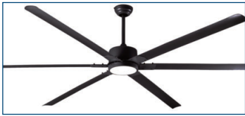
CP96-LEDBK - Complete with light kit