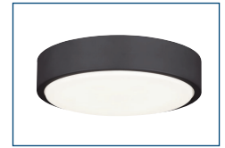
LK-CPBK - Matte Black