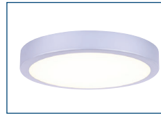
LK-CPPG - Grey